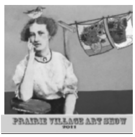
Prairie Village Art Show June 3, 4, & 5