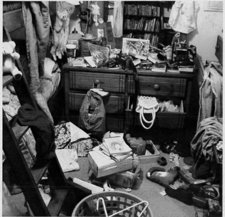
Is Your Space Cluttered?

Since 2004 Brookside Pet Concierge Services 816.694.9296