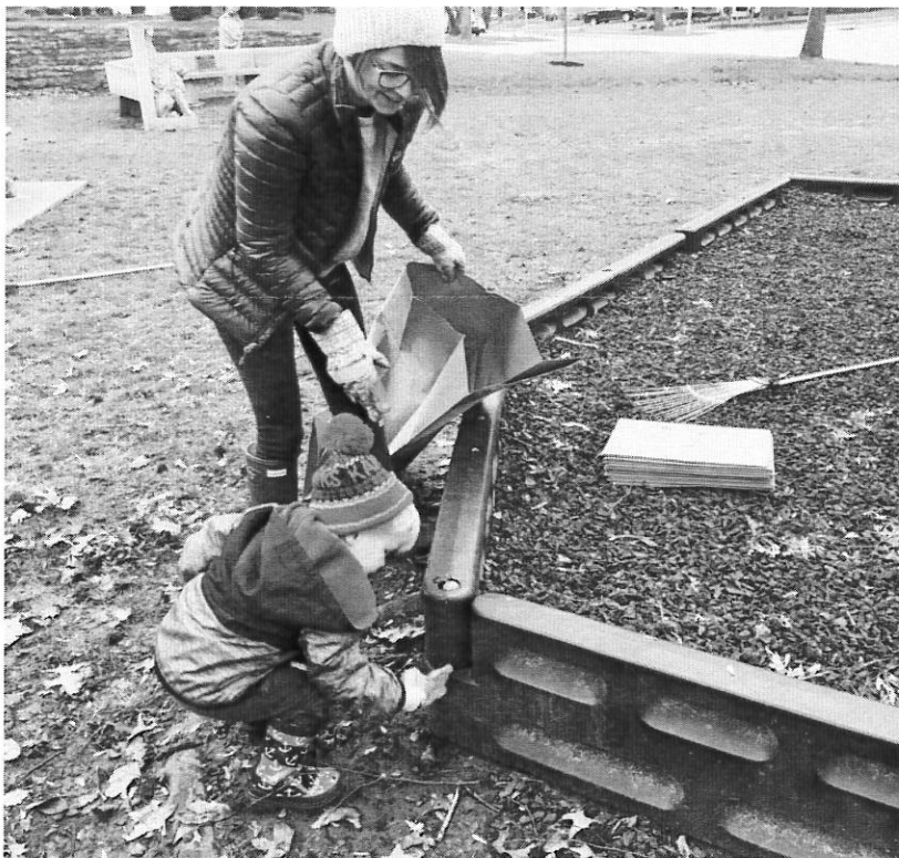
Spring Cleanup at Greenway Fields Park