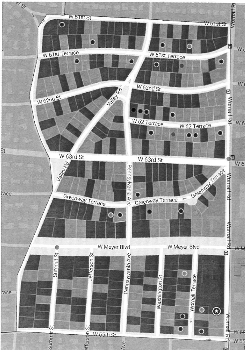
Nextdoor Neighborhood Map—Shaded Plots are Nextdoor Members