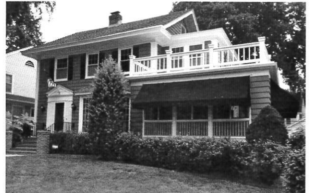
644 West 61st Ter—Now