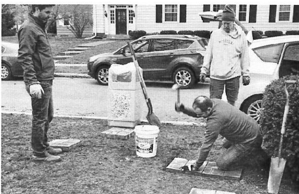
Doggie Waste Station at Greenway Fields Park—Installation

~~~~~ “Let us make a united drive to end fleeting and shifting uses of property—let us build enduring homes and neighborhoods; permanent business, commercial and industrial areas with lasting values, all planned for a century or more.” ~~~~~ From the J.C. Nichols speech on Planning for Permanence. 1948 ~~~~~