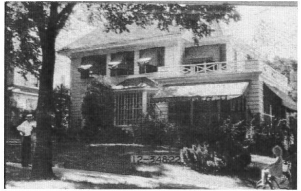
644 West 61st Ter—Then

Company's most prolific period of the 1910s and 20s. Its association with the Country Club District would be enough to make it worthy of historical consideration. But that affiliation with the District is only part of the neighborhood history to be told. From the birth and early years of a neighborhood growing up between World Wars, through the post-WWII era when emerging social issues confronted American communities, and in to more recent decades as it confronts the issues challenging modern neighborhoods, Greenway Fields' story continues to focus on new approaches to maintaining its sense of community.