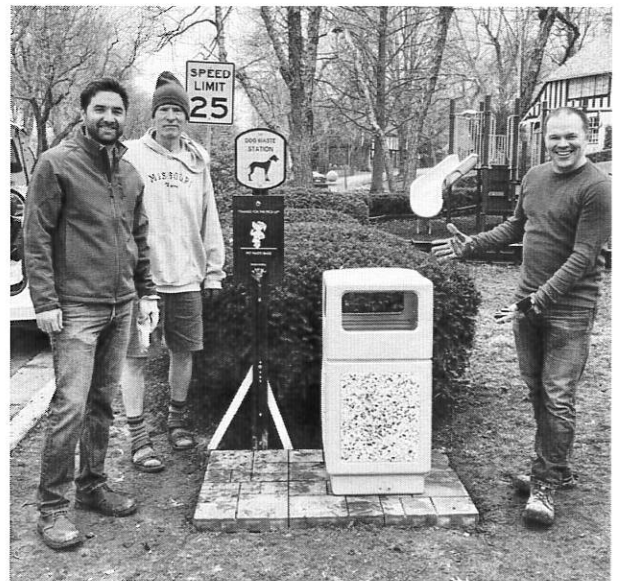
Doggie Waste Station at Greenway Fields Park—Completed