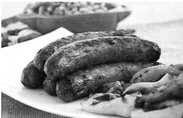
Scimeca's gilled Italian sausages