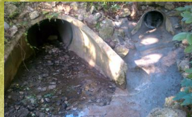
Photos from some of the ravine work that was completed earlier this summer.