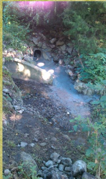
Many of the larger rocks had been washed from the West side of 77 th street over to the East side. Work was done to remove the rocks, shore up the banks and put concrete in to keep future storms from washing more rocks away.