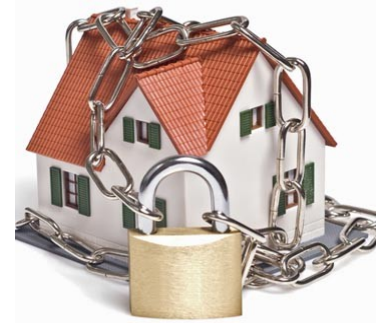
Keeping your home secure is more important than ever.

Park Off Street. Parked cars on the street, make good hiding places. An empty street is completely uninviting to criminals.